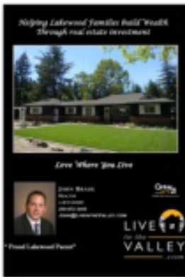
Half & ¼ page ad example (Left facing)